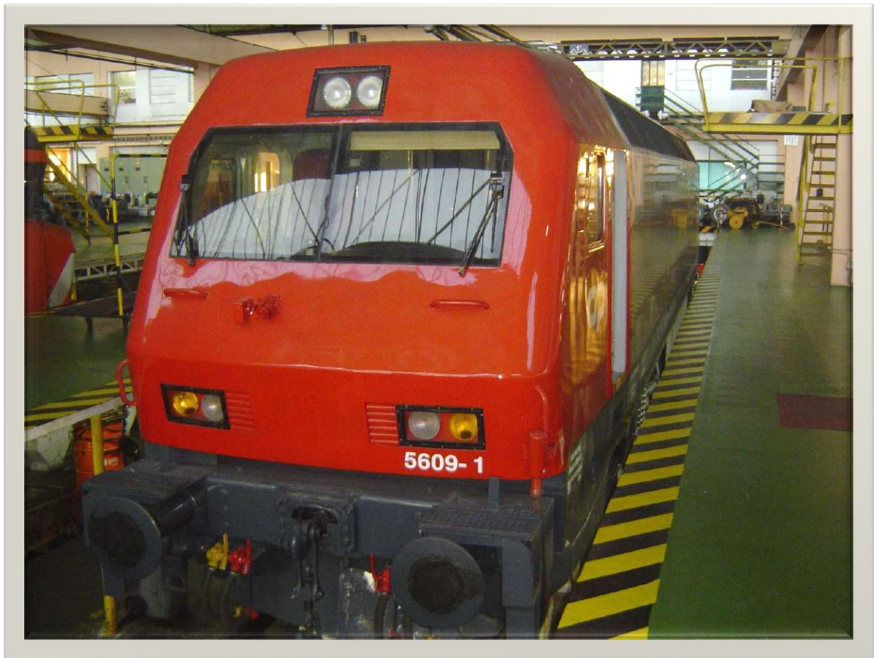
A Comboios de Portugal train protected by Tecma Paint Anti Graffiti

If a substrate's colour is altered by the application of Tecma Paint Anti-Graffiti, a prior coat of Imprimacion A will prevent this happening