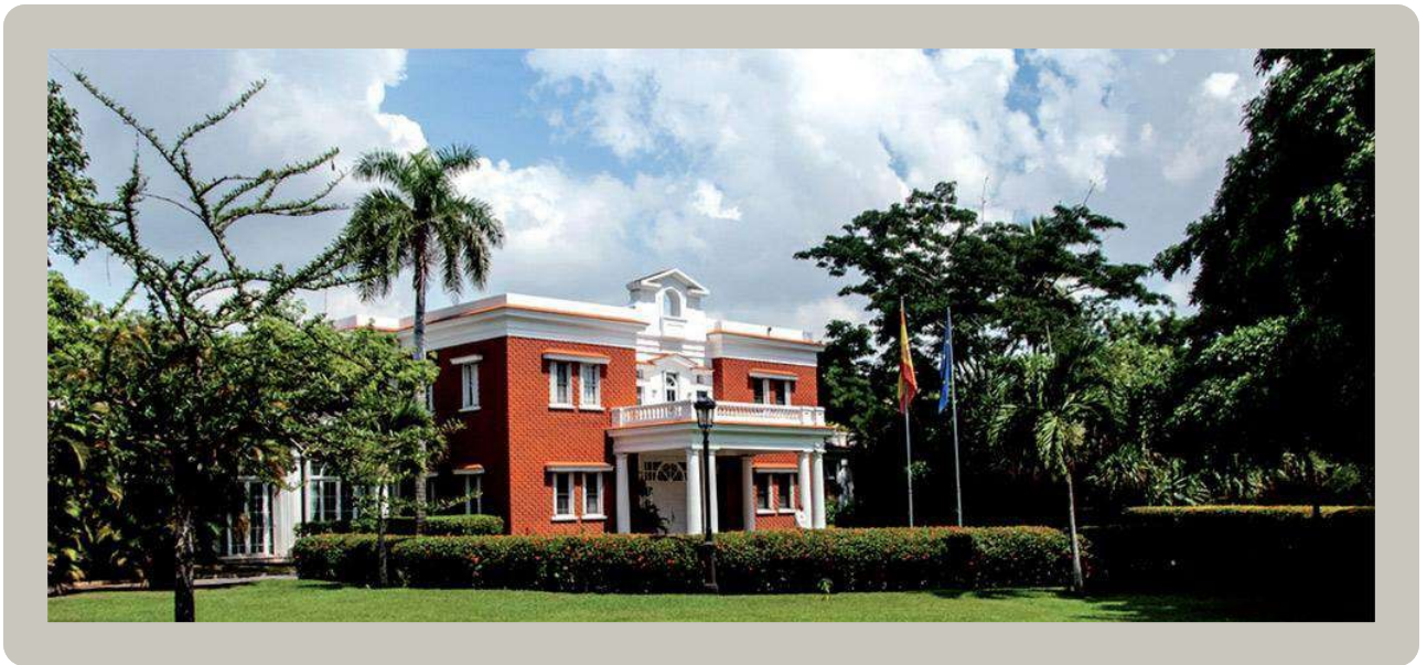
Spanish Embassy, Dominican Republic, swimming pool waterproofed with Tecmadry Elast